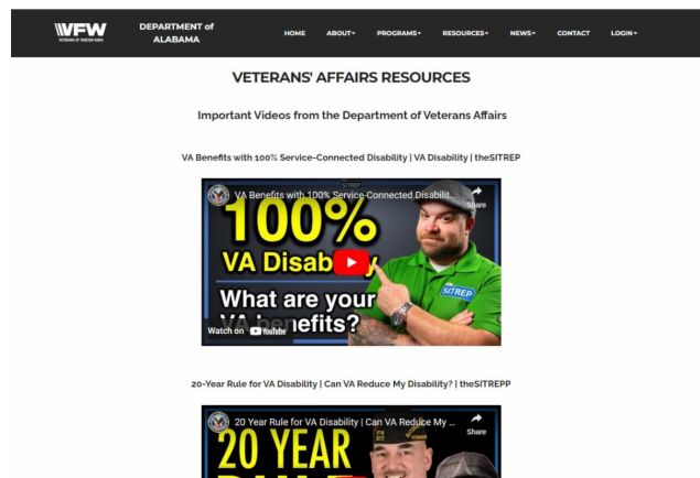
Department of Alabama