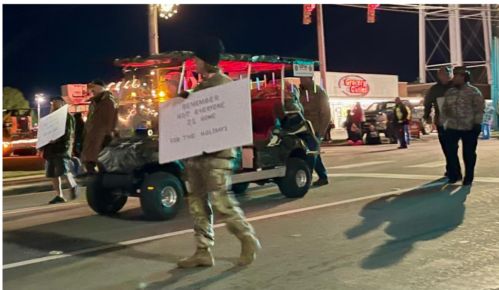
Enterprise Christmas Parade, November 28, 2023